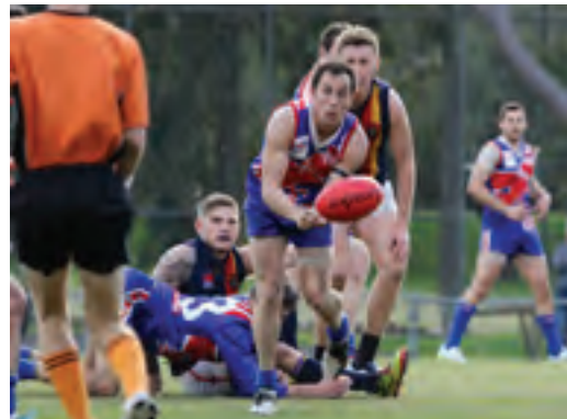
KEYSBOROUGH VS CAULFIELD

Photos can be purchased from www.photogenix.com.au