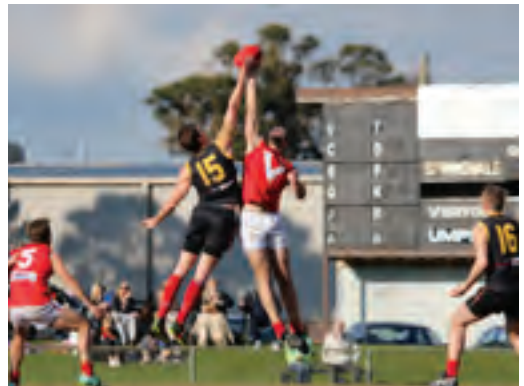
DINGLEY VS EAST BRIGHTON