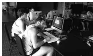
Werribee VFL completing baseline testing

A player who works full time and already has a history of depression took a head knock during a game earlier in the year. It seemed minor and there was no loss of consciousness (92% of concussions occur with no loss of consciousness). He attended training the following Tuesday and mentioned to his trainer he was experiencing headaches and dizziness. He called us, and our immediate advice to him was to miss Thursday training, and we booked him in for a post injury test.