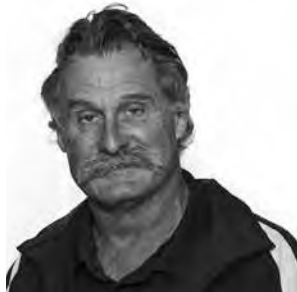
premierships – captain-coach in one.